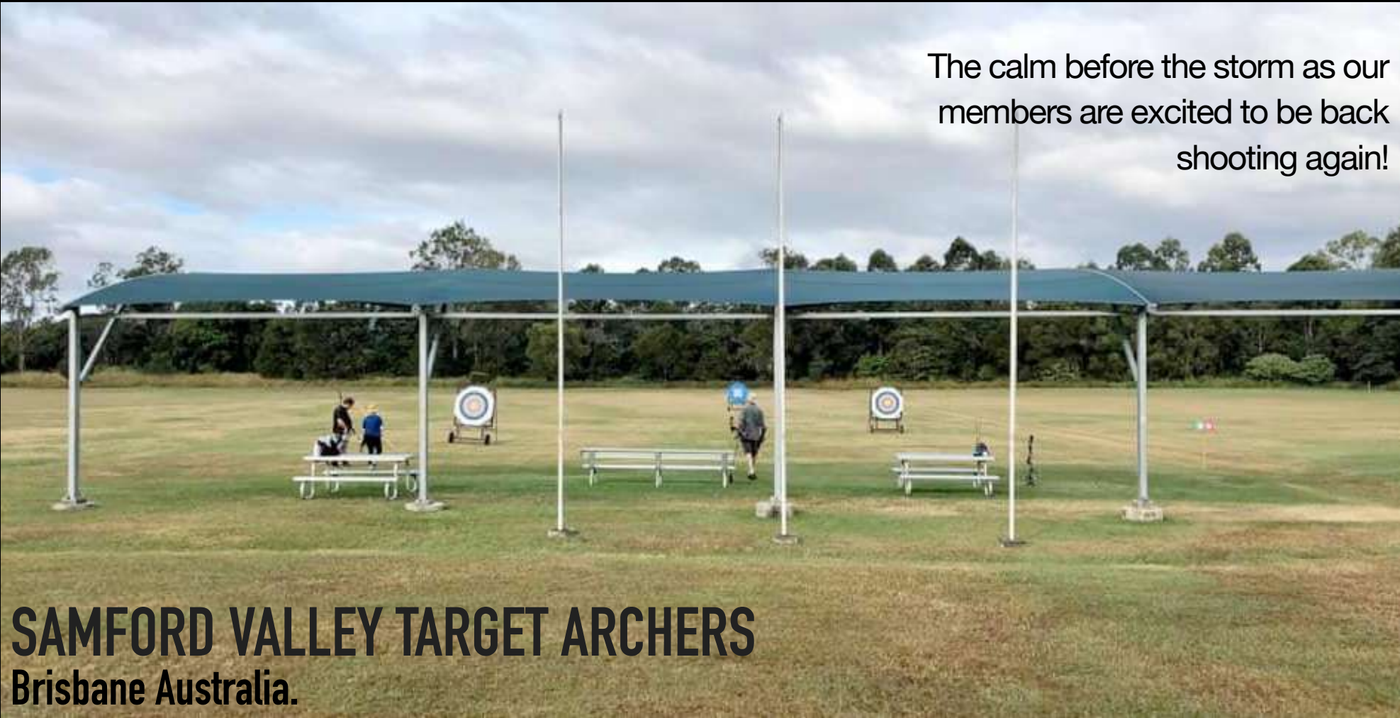
The calm before the storm as our members are excited to be back shooting again!